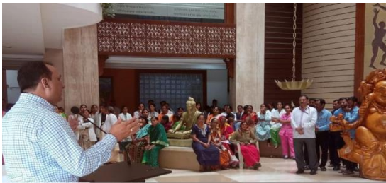
staff, 33 PG Scholars, 29 Non Teaching staff and patients.